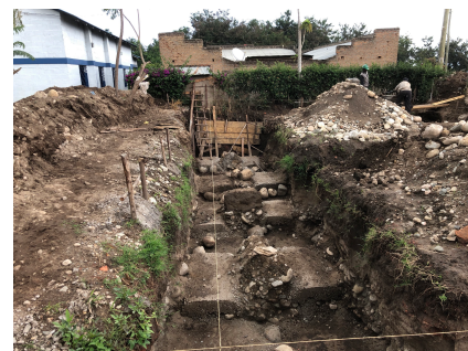
Starting on the building construction