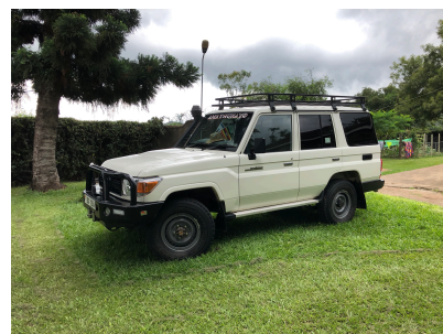
2019 Toyota LandCruiser