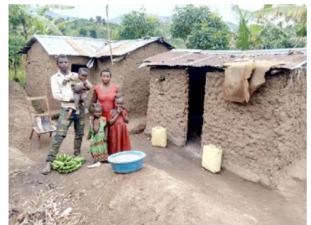
People receiving food