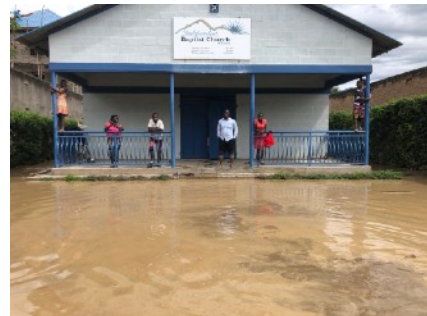
Flooding around the church

We have been planning for several months the charter service for the Independent Baptist Church of Karusandara. The lockdown restrictions has made our plans very difficult to be realized. However, we are pushing on but we might be delayed a little bit. I just recently met with the leaders of the church and told them to begin working on a church constitution and other preparations for the charter service. Praise the Lord for another church that is preaching the Gospel.