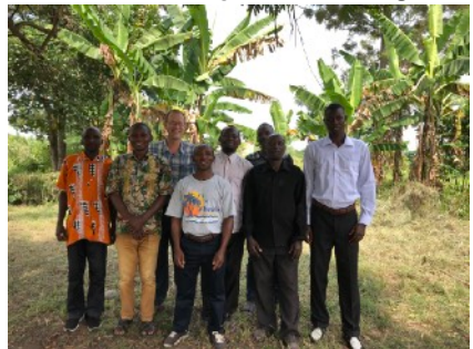
Leaders in Karusandara

PO Box 66 Kasese, Uganda E. AFRICA +256 792 518 113/2