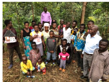
Core of believers from Ribweryakona

As the lockdown restrictions were eased a bit, the men started going every week for discipleship. They began to have a core of believers who really wanted to know the truth and were willing to apply it. We scheduled a baptism service in November. Many had planned to be baptized, but because of the pressure from relatives, only three accepted to obey the Lord in believer's baptism. We were encouraged by the response from the village in what we were preaching. Others have taken courage from these three, and we are already planning a second baptism. Please pray for this new preaching point that God will give us wisdom in planting another Bible believing Baptist church.