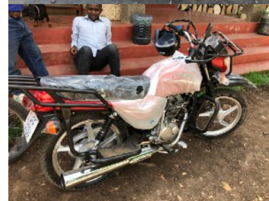
New Ministry Motorcycles