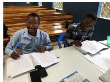
Students learning Greek