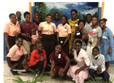
Deaf Conference Attendees

PO Box 66 Kasese, Uganda E. AFRICA +256 792 518 113/2