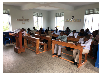
Bible college class with 21 students

We were also able to open our Bible college again. We have 37 students this term taking the courses of Sign Language Interpreter's Training, the book of Revelation, Bible Doctrines 1, and the books of 1&2 Timothy. We have three of our graduates teaching some of these classes. What a blessing that is!