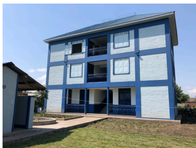
Multi-purpose building in Kasese

We are so grateful for God's provision in completing our multi-purpose building in Kasese town. We are already using it for children's SS and Junior church, Youth 4 Christ, Singles, Ladies Bible study, Bible college, translation work and a dormitory. Again we want to thank all of you who prayed for this and even gave to finish its construction. To God be the glory!