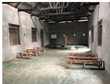
Inside the church in Karusandara

We are also thankful for the completion of the construction of the church building in Karusandara. God has blessed through some generous gifts from churches for which we are very grateful.