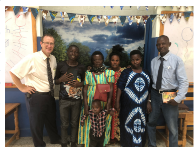
Five Who Were Baptized On The Church Anniversary