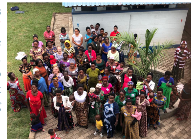
1st Ladies Conference

We had the blessing and honor of hosting our first Ladies Conference! There was a total of 56 ladies that came from 7 churches! Many of these ladies never before had the opportunity to do anything like this or even leave their village. They were excited to learn for the two full days and also enjoyed fellowship with so many other Christian ladies. What an encouragement it was! Many said they would start saving for the next conference and would invite more ladies!