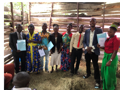
Independent Baptist Church of Ribweryakona members

After Covid-19 disturbed us for a while, we were able to continue the training of the disciples in Ribweryakoyona—the mountain village we had been going to for some time. During that training we did a lot of soul-winning, discipling, teaching, and preaching. On August 20, 2023, we officially opened the Independent Baptist Church of Ribweryakona (rēēb-wēryā-chōnā). We had eight actually sign the constitution, with one sick not being able to sign and two others signing at the end of the day (as they were getting married later). With over 300 in attendance the church has begun with a great testimony in the village there. We pray God's blessing on His new church. Please pray for the new church members as they strive to serve the Lord faithfully.