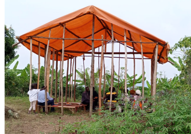
Our new temporary structure up in Kyishanyarazi