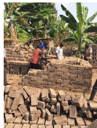
Making bricks for the church building in Kyinyayoby

PO Box 66 Kasese, Uganda E. AFRICA +256 752 518 113/ +256 756 437 774