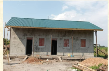
Administration building for the school

In order to build the needed structures, get the necessary paperwork and registration approval, and provide the administration and teacher salaries for the first year, we will need several thousand dollars. We praise the Lord that we have already been given 60% of what is needed to begin the work. We are trusting God to provide the remaining funds. Would you please pray and ask the Lord if He would have you assist with this need? For any more information or any questions, please email and ask.