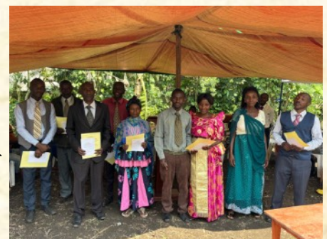
New church members in Kajwenge

We enjoyed celebrating this special day in the mountain village of Ribweryakyona. We had several elected officials and even the police chief from that area come on that day. What a blessing to know that the church is reaching out into the community with the Gospel of Jesus Christ.